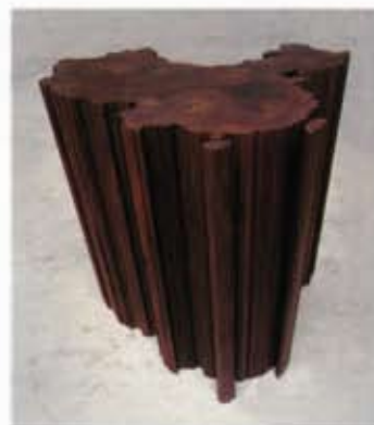
Opposite page, from top: Ai Weiwei, June 1994 , black-and-white photograph. Ai Weiwei, Concrete , 2000, concrete. Installation and interior views, SoHo NewTown, Beijing. Ai Weiwei, Study of Perspective—Tiananmen , 1995–2003, color photograph. Ai Weiwei, Study of Perspective—The White House , 1995–2003, color photograph. This page, clockwise from left: Ai Weiwei, Chandelier , 2002, crystal chandelier and scaffolding, 17 x 13 x 13". Ai Weiwei, Map of China , 2003, wood from Qing dynasty temples, 31 1/2 x 39 1/4 x 39 1/4". Herzog & de Meuron's Olympic Stadium under construction, Beijing, 2006. © Herzog & de Meuron.