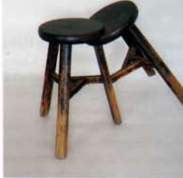
Opposite page, from left: Ai Weiwei, Hanging Man/Duchamp , 1985, coat hanger, 26 1/2 x 20". Ai Weiwei, Violin , 1985, shovel handle and violin, 9 x 24 1/2 x 2 1/2". Ai Weiwei, Han Dynasty Urn with Coca-Cola Logo , 1994, Western Han-dynasty urn and paint, 9 1/2 x 11 x 11". This page, clockwise from top left: Ai Weiwei, Stool , 1997, Qing-dynasty stools, 11 x 23 1/2 x 23 1/2". Ai Weiwei working on Still Life , 1993-2000. Ai Weiwei, Safe Sex , 1986/1988, raincoat on hanger with condom, 61 x 39 1/2 x 4 1/2". Ai Weiwei, Dropping a Han Dynasty Urn , 1995, three black-and-white photographs.