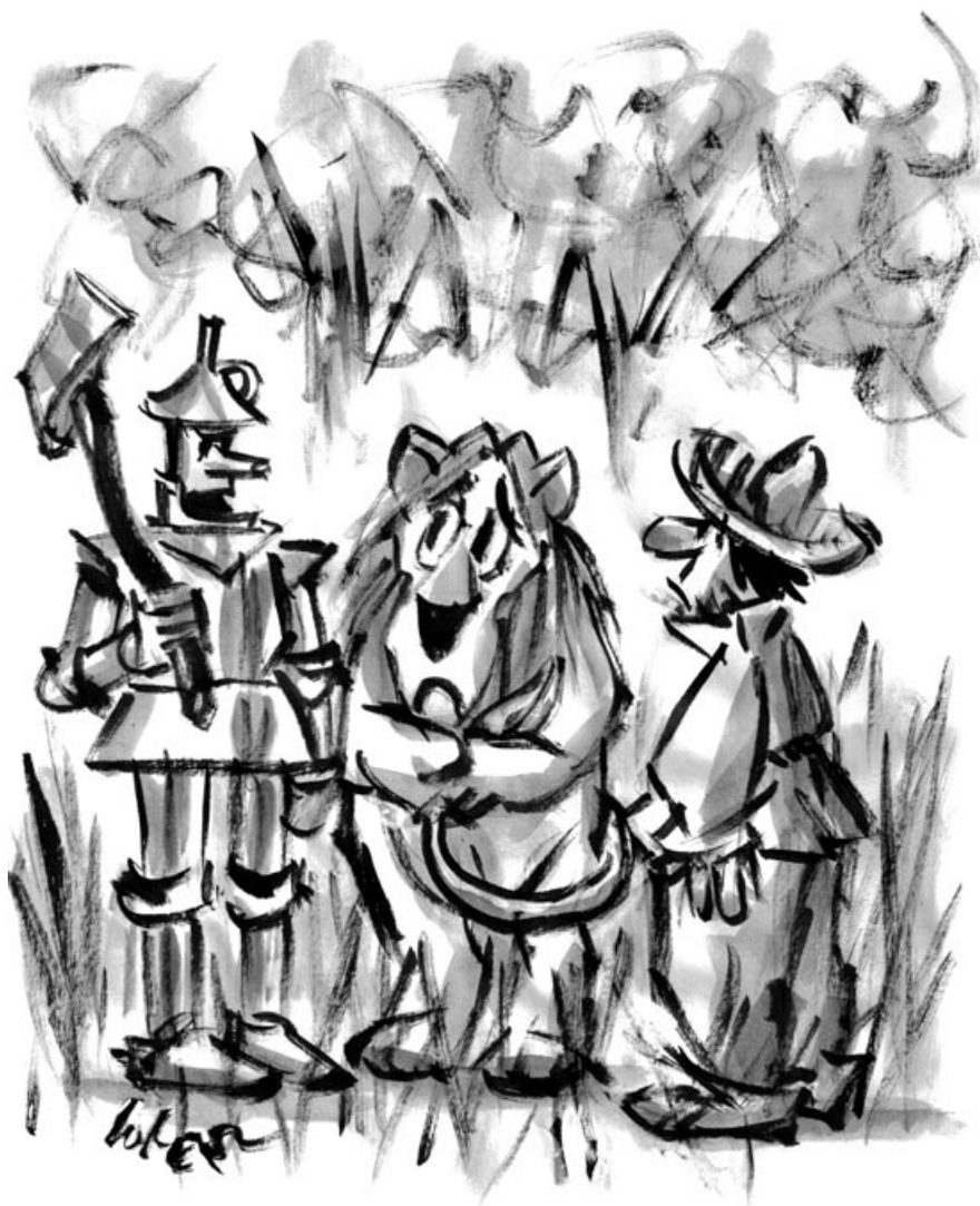
“Iron Man—why didn't I think of that?”